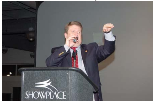
The Mendenhall team make another wonderful auction work like a charm.