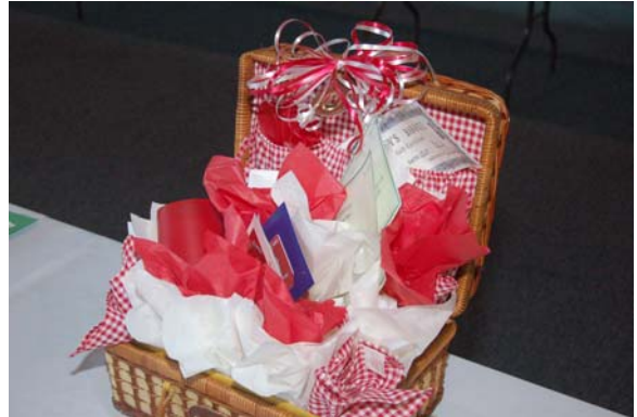
Silent Auction theme baskets may set a new trend.