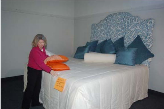
Some day we won't believe the 8x8 bed.

WHILE WE WAIT FOR LAST NIGHT'S AUCTION RESULTS . . . All indicators ... at least I have a gut feeling ... suggest that most every auction record that could be broken was. Prepare for an awesome auction report Monday.