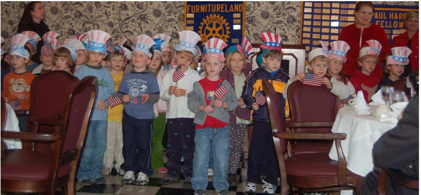
The Wesley Memorial United Methodist Church Kindergarten Choir helped celebrate Veteran's Day with a heart-warming rendition of 'God Bless America' followed by an encore of 'Jesus Loves Me.' Some suggest it was the program that we all will remember for years to come.